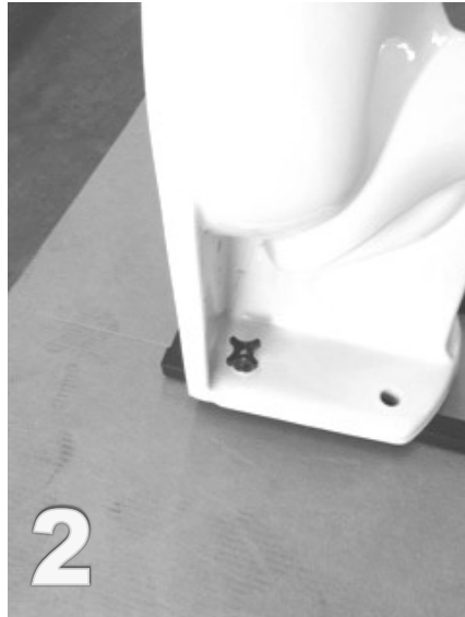
Install supplied wing nuts.