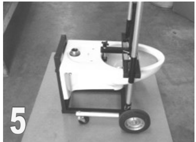
Place Toilet Kart on toilet.