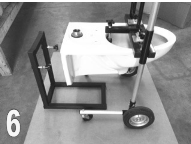
Ready to install...

THIS ITEM SHIPS IN 2 PIECES WITH THE NECESSARY BOLTS TO ASSEMBLE.